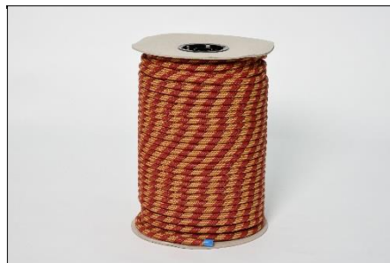
MASTERTUBE injection hose

High demands are placed on the technology used to seal concrete construction joints. The MASTERTUBE injection hose ensures reliable and permanent sealing of horizontal and vertical concrete construction joints against pressurised and non-pressurised water.